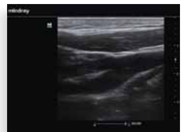
Carotid Artery Bifurcation